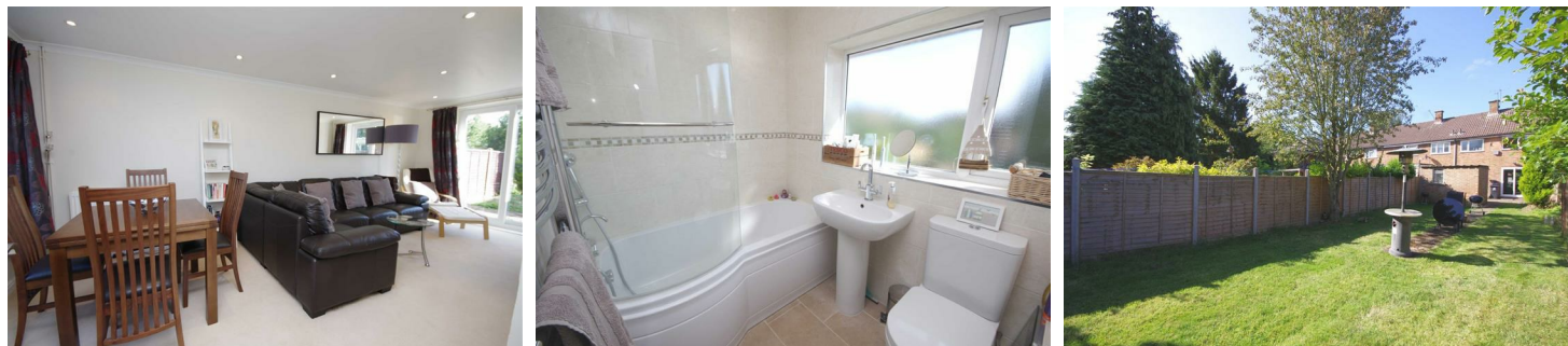
Ground Floor Approx. 35.3 sq. metres (380.0 sq. feet)

Positioned to the east side of St Albans and with attractive views overlooking a green is this deceptively spacious, three bedroom family home. Beautifully presented throughout with living accommodation that is both bright and roomy combined with a modern day atmosphere. To the ground floor, the property enjoys a stylish black gloss fitted kitchen with solid oak wood work top surfaces over, and a light filled dual aspect lounge/diner with patio doors that open to the outside. Upstairs are three ample sized bedrooms and a contemporary family bathroom. The property is further complemented by a generous sized and low maintenance rear garden and two brick built cupboards, ideal for storage or conversion (stpp). Cell Barnes Lane is conveniently situated for highly regarded schools and good local amenities. St Albans city centre and the mainline railway station remains only a short distance away via car or bus.